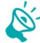
Media and influencers