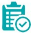
Policy makers and regulators